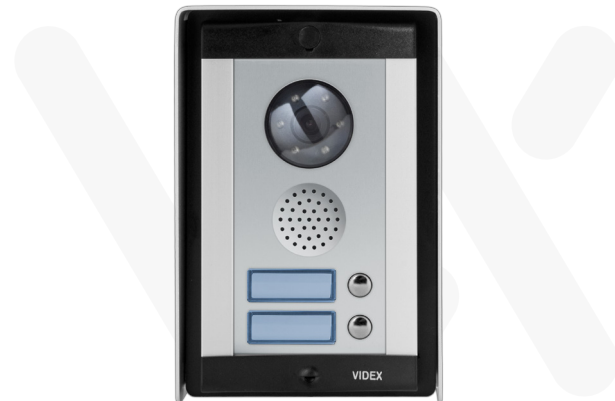
*(8855 with 8875 and 8833-2/C video module)